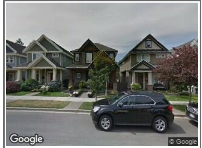
Property Image Date: Jul 2015