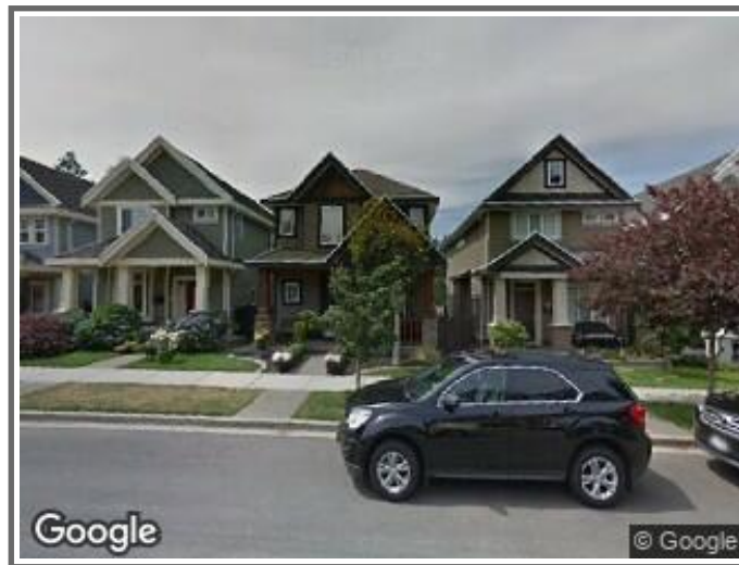
Property Image Date: Jul 2015

Legal Description: Narrative: Lot 6, Plan BCP23039, District Lot 165, Group 2, New Westminster Land District