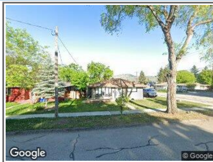
Property Image Date: May 2021