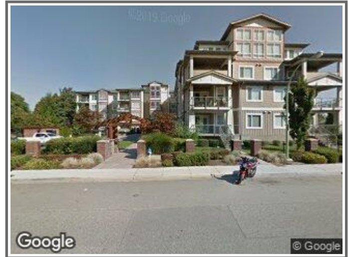
Property Image Date: Aug 2014