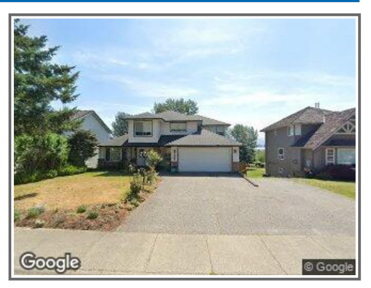
Property Image Date: Jun 2023