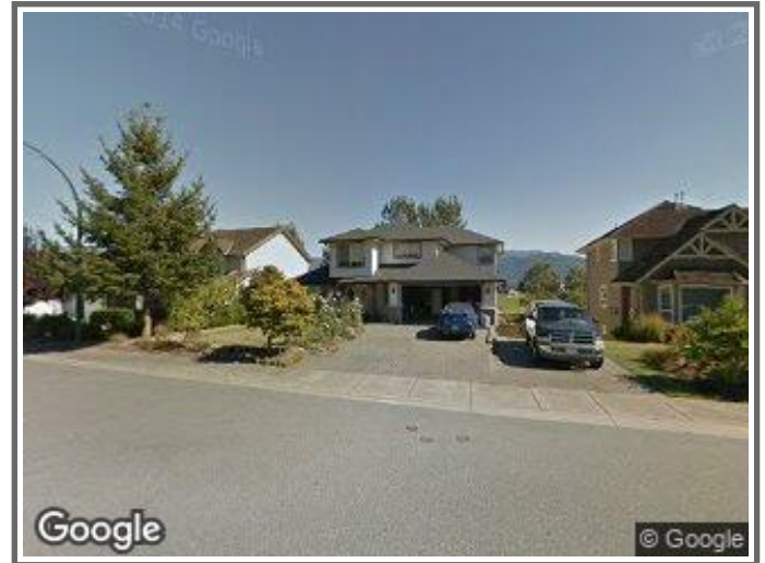
Property Image Date: Sep 2014

Legal Description: Narrative: LOT 21, PLAN LMP15966, DISTRICT LOT 95, GROUP 2, NEW WESTMINSTER LAND DISTRICT